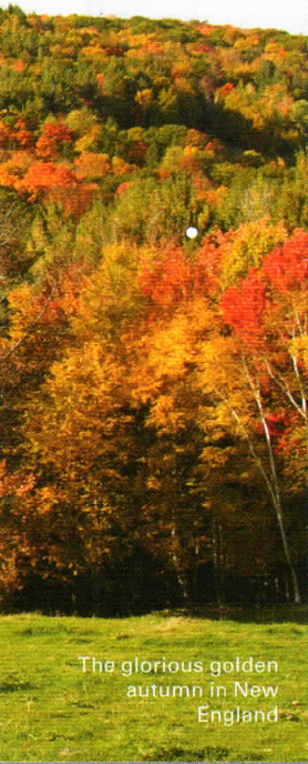
The glorious golden autumn in New England